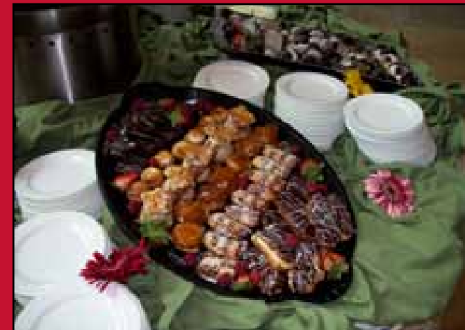
Buffet Served with Freshly Brewed Regular Coffee, Decaffeinated Coffee & Hot Tea