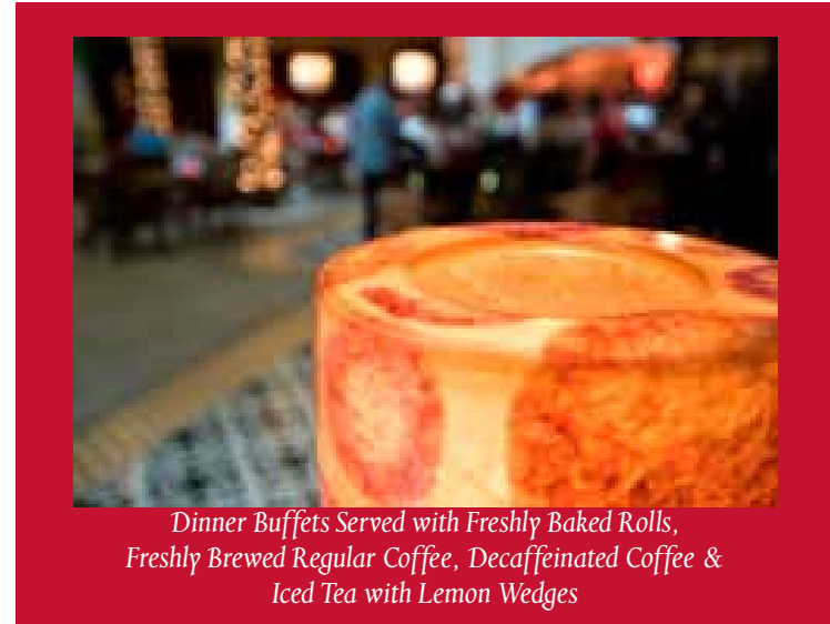
Dinner Buffets Served with Freshly Baked Rolls, Freshly Brewed Regular Coffee, Decaffeinated Coffee & Iced Tea with Lemon Wedges

Bibb Lettuce, Cucumbers, Red Onions, Grape Tomatoes Buttermilk Dressing & Maple Vinaigrette Watermelon Salad Creamy Jicama Slaw Pecan Crusted Grouper with Apple Cider Butter Sauce Smoked Chicken Thighs with Honey- Chipotle Glaze Slow Roasted Beef Brisket, Maple & Shiner Bock Beer Glaze Roasted Corn on the Cob Red Skin Mashed Potato Grilled Vegetable Zucchini, Squash, Carrots & Red Peppers Cornbread Muffins Chef's Mini Dessert Table to Include: Bread Pudding, Carrot Cake with Dried Cherries & Ancho Chocolate Cowboy Brownies ADD: Baby Back Pork Ribs - Market Price