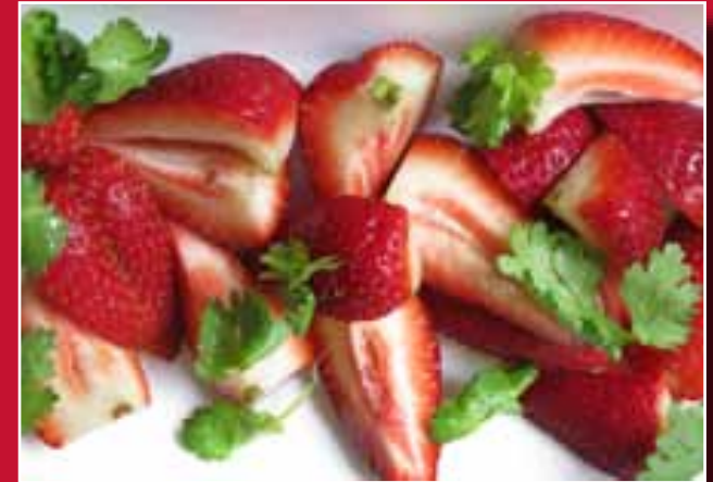
Breakfast Entrées Include: Choice of Starter & Entrée, Orange Juice, Assorted Breakfast Pastries, Freshly Brewed Regular Coffee, Decaffeinated Coffee & Hot Tea