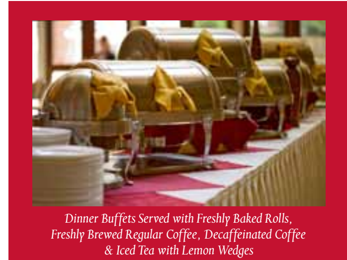
Dinner Buffets Served with Freshly Baked Rolls, Freshly Brewed Regular Coffee, Decaffeinated Coffee & Iced Tea with Lemon Wedges